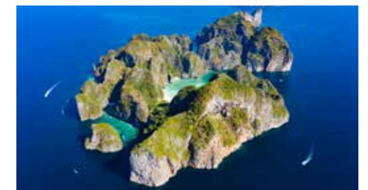
12. Phi Phi Islands Snorkeling, island shops and scenic bays, from Maya Bay to Monkey Beach.