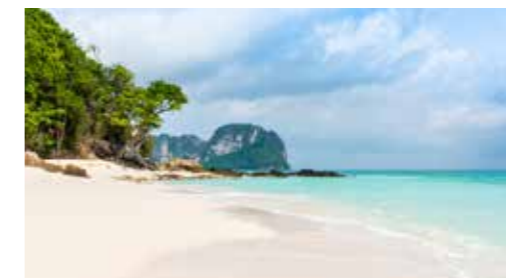
11. Bamboo Island Soft white sands and beautiful underwater coral gardens, ideal for snorkeling.