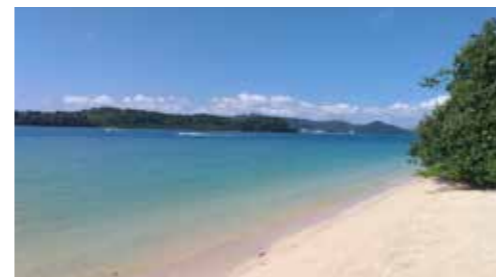
4. Naka Island A scenic spot for snorkeling and swimming amid the bay's karst scenery and soft sands.