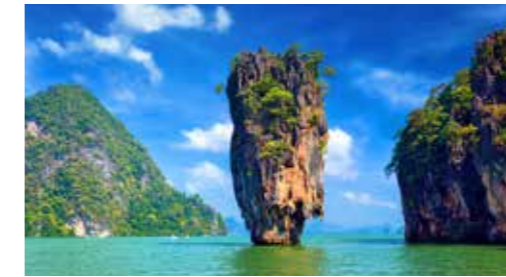
2. James Bond Island The limestone pinnacle that featured in the 1974 film The Man with the Golden Gun .