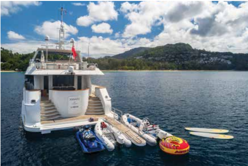
Aft deck and toys