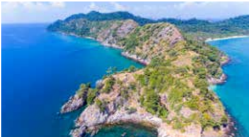
4. Koh Ngai An island of evergreen forests, coconut palms, sandy beaches and snorkeling spots.