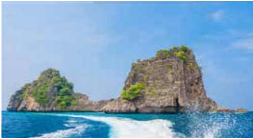
7. Koh Rok A quiet island for snorkeling, diving or walking on the white sand beach.