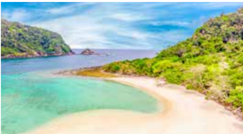
3. Koh Haa (Five Islands) A popular dive spot with underwater caverns, lagoons and vibrant marine life.