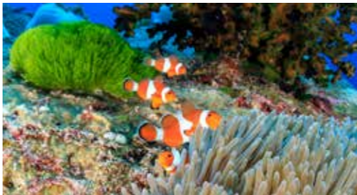
2. Similan Islands Some of the world's best diving spots with hard and soft coral around 11 islands.