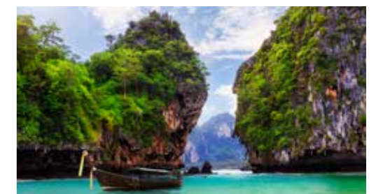
9. Hong Island Krabi A lagoon hidden in a wall of limestone cliffs, ideal for kayaking, snorkeling and swimming.