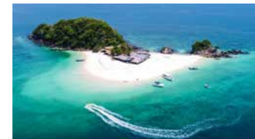
5. Khai Islands Three small islands with crystal waters, unique rock formations and colorful coral.