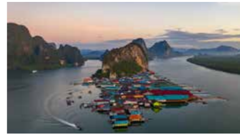
1. Panyi Village A floating fishing community with shops, a mosque and a football field built on water.