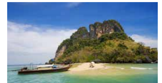
6. Coral Island (Koh Hae) Soft sand beaches, ideal for watersports and snorkeling in impressive coral reefs.