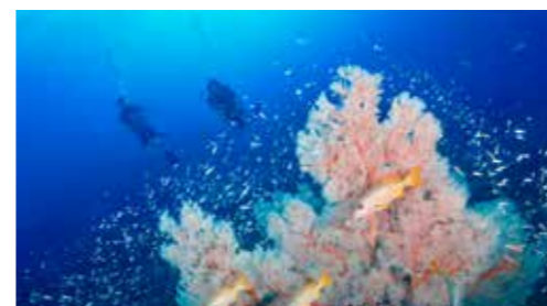
7. Racha Island Popular for diving and snorkeling, the island features fine white sands in a U-shaped bay.