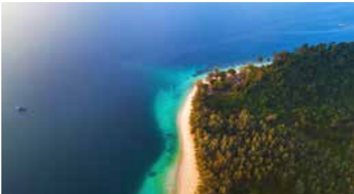
6. Koh Kradan Rubber and coconut plantations framed by white sand beaches and coral reefs.