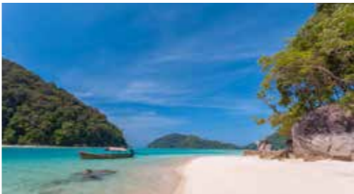
1. Surin Islands Five islands with coral gardens and a sea gypsy village, ideal for diving and snorkeling.