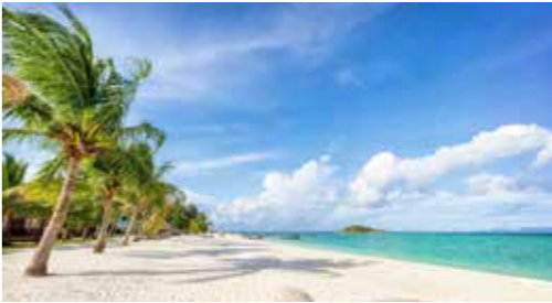
9. Koh Lipe An L-shaped island surrounded by clear waters and coral for diving and snorkeling.