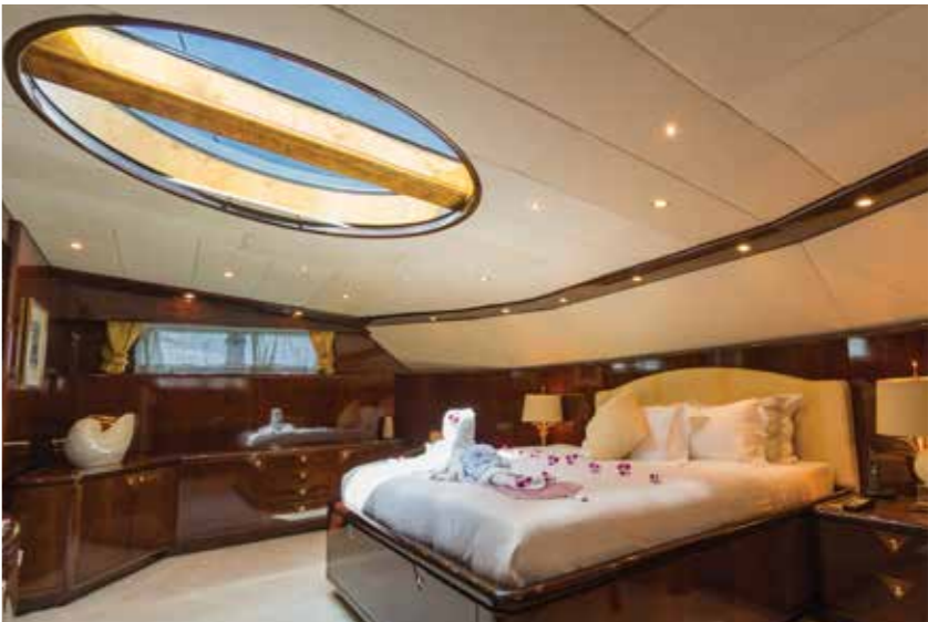
Master suite with skylight