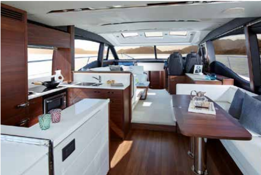
Cockpit and galley