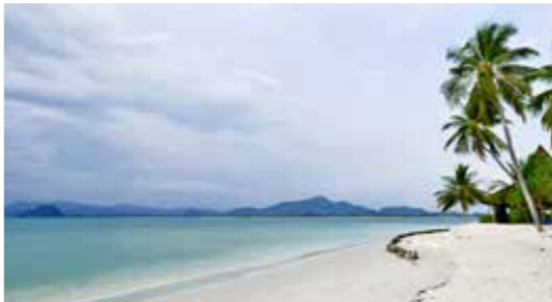
5. Koh Muk Tall cliffs with swallow's nests, a village and Emerald Cave, accessible only by boat.