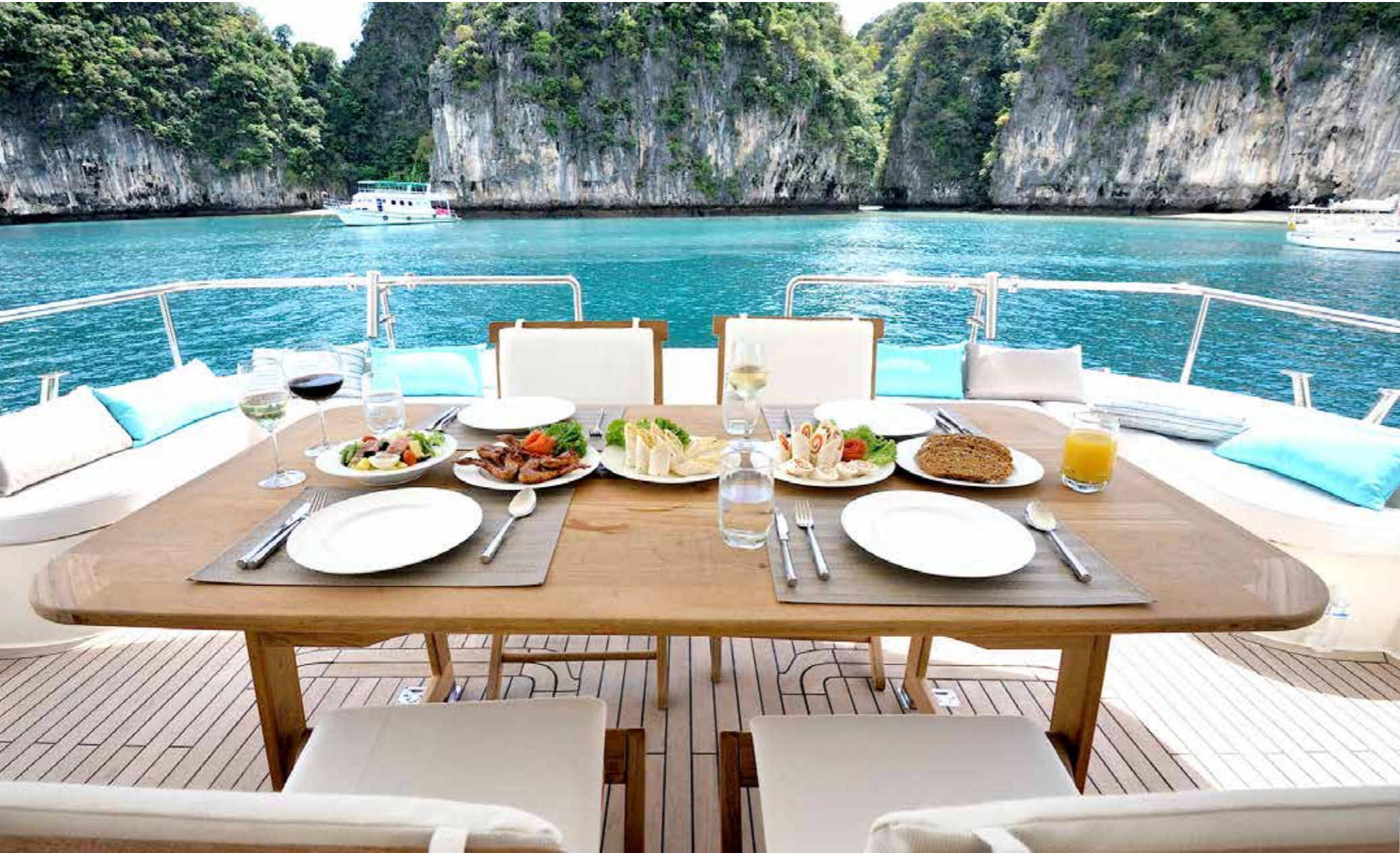
Open-air dining deck