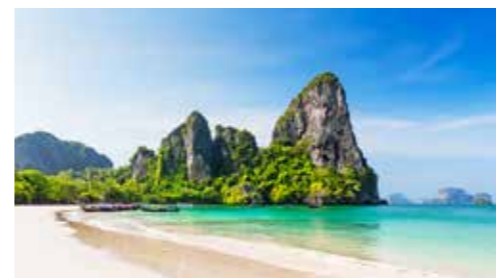
10. Railay Beach, Krabi A small beach with scenic sunsets and caves and cliffs for rock climbing enthusiasts.