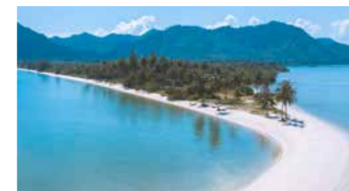
8. Koh Yao Yai & Koh Yao Noi Two islands famous for white beaches and coral reefs for swimming or snorkeling.