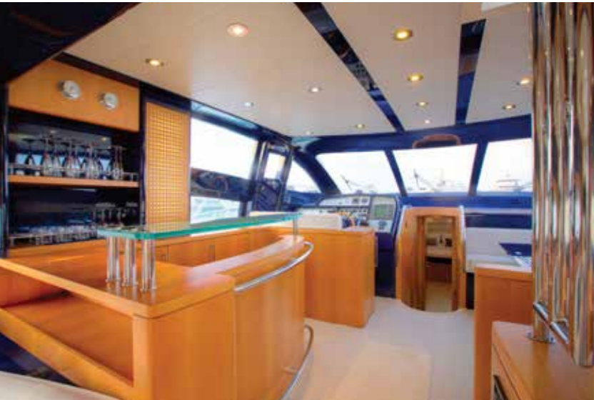
Cockpit and galley