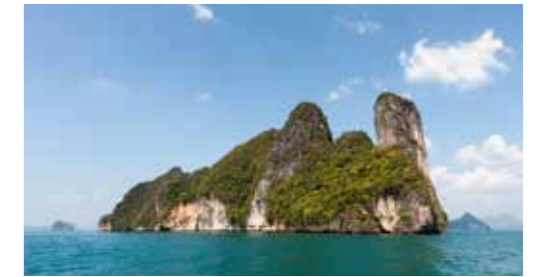
3. Phanak Island An island of limestone cliffs, caves and lagoons that can be explored by kayak.