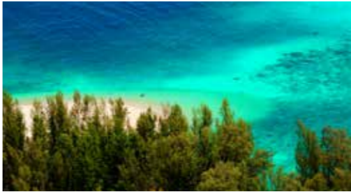
8. Koh Adang Several dive spots with an abundance of coral and fish near the Malaysian border.